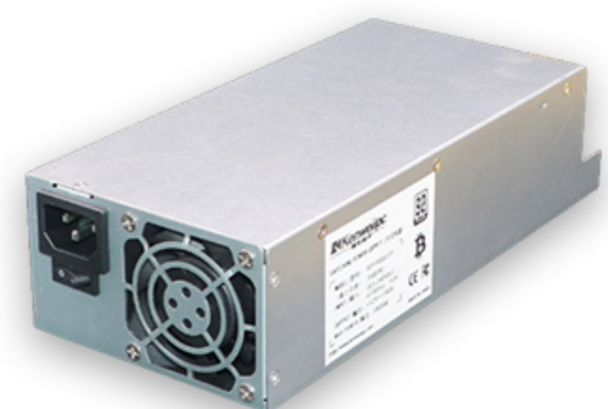
Industrial Control System Power Supply